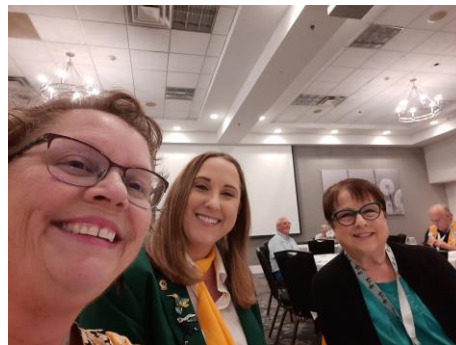
Together at the District cabinet meeting in Temple