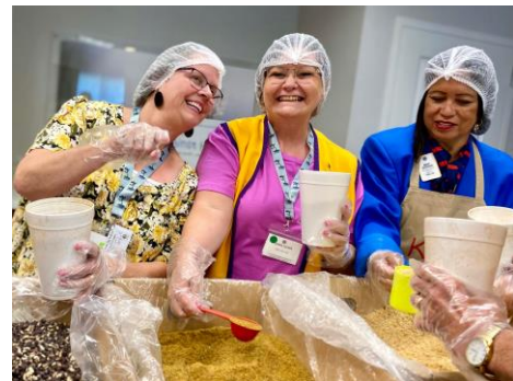
Serving during the district service project-packaging meals to go to Ukraine