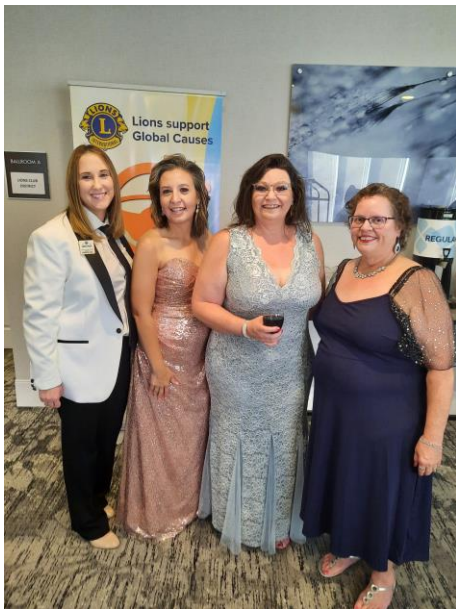
Hanging out with Clifton Lions Club members before the District Governor's banquet