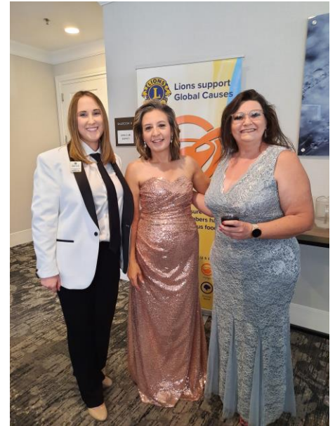
All dressed up and ready for the district governor's banquet