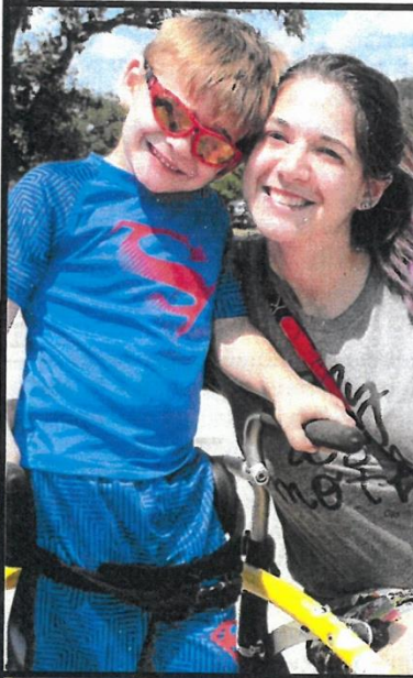
Children Can...With TLC™

TLC is tax exempt under 501(c)(3) of the I.R.S.—Donations are tax deductible—see your tax professional for details.