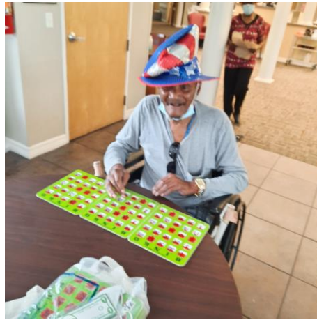
Uncle Sam at KNLC bingo at the Rosewood