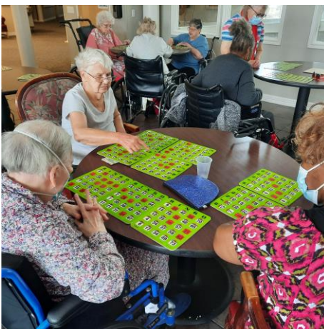
← Serious bingo at the Rosewood