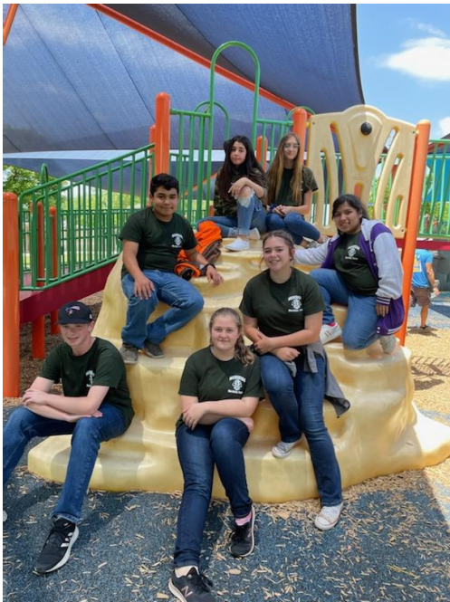
Meridian Leos at Temple Lions Park