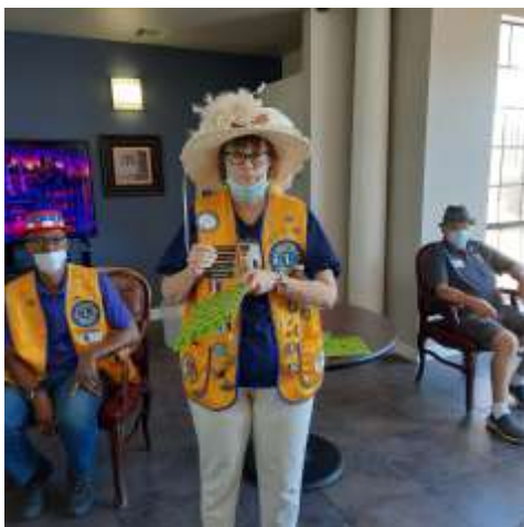
Crazy hats at Rosewood Bingo