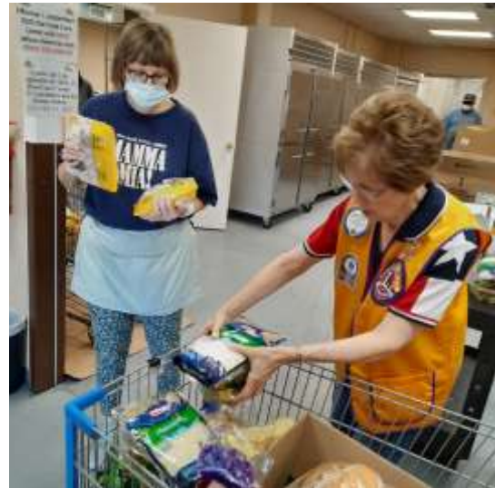
Killeen Food Care Center