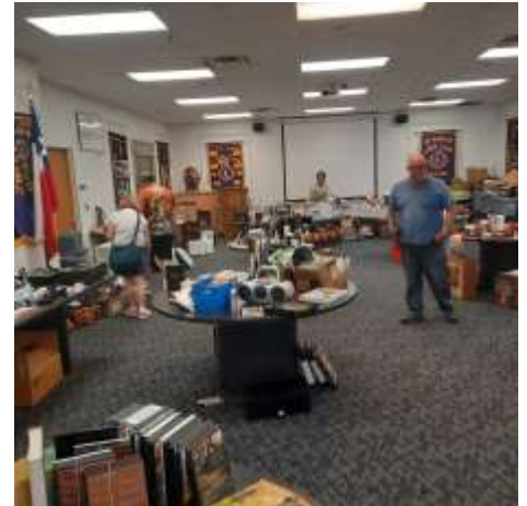
Killeen Noon Lions Yard Sale