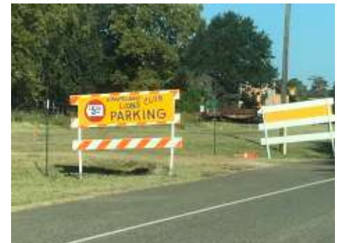
Grapeland Noon Lions Park Cars at the Peanut Festival as a fundraiser for the club. The parking lot transfers from Railroad ride away to a parking lot when the lions get busy roping and flagging on Friday for the big day on Saturday. A long hot day for the lions but a lot of fun for all the visitors. Thanks to all who parked with us!