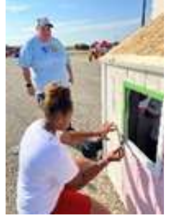
Habitat for Humanity Playhouse Project