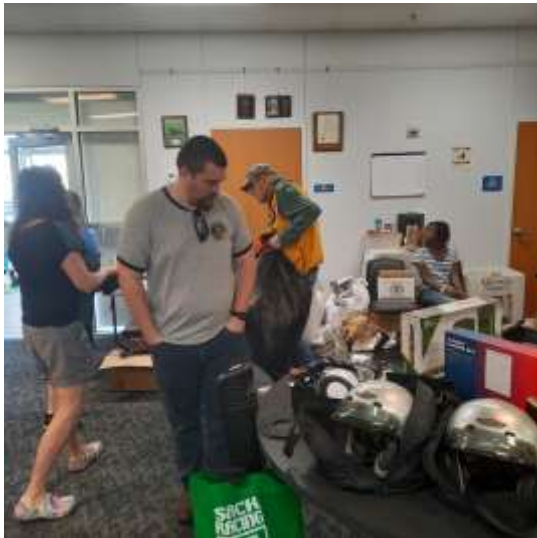
Killeen Noon Yard Sale