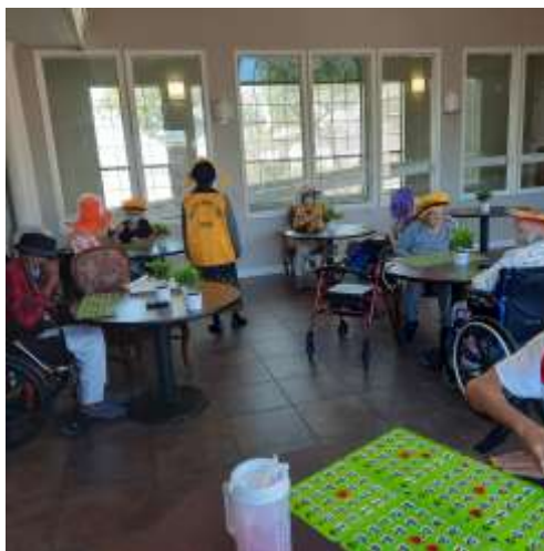
Crazy Hat Bingo at the Rosewood