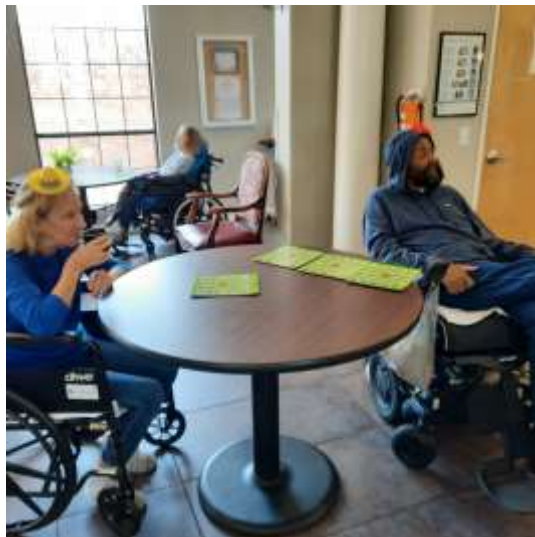
Playa de Bingo at the Rosewood