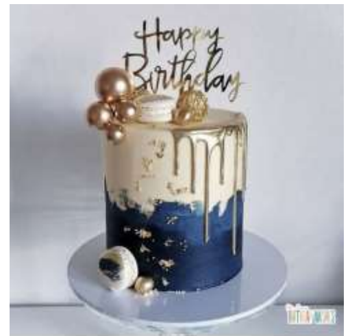
Robinson Area recognized 9 years as a club on May 27 th .