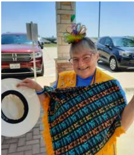
Ready to play Bingo