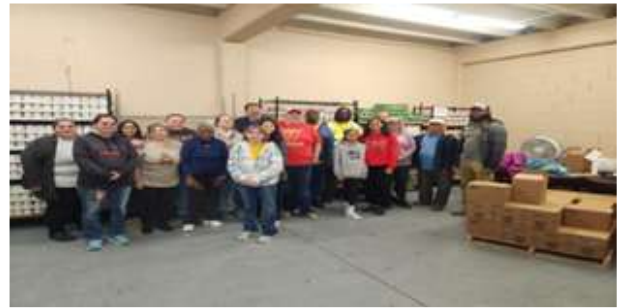
Right: Killeen Food Care Center Project 02/18/2023