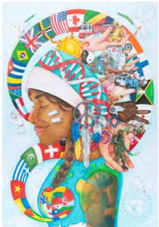
International Peace Poster winner