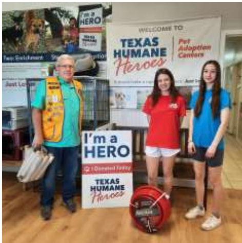
Humane Heroes donation