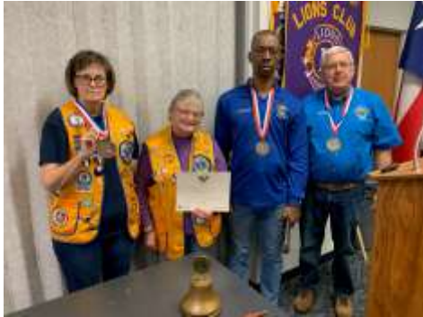
Killeen Food Care Center awards